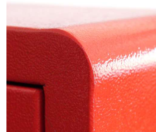
All sides are rounded